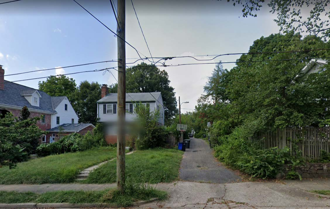
Alley entrance from Ellicott Street