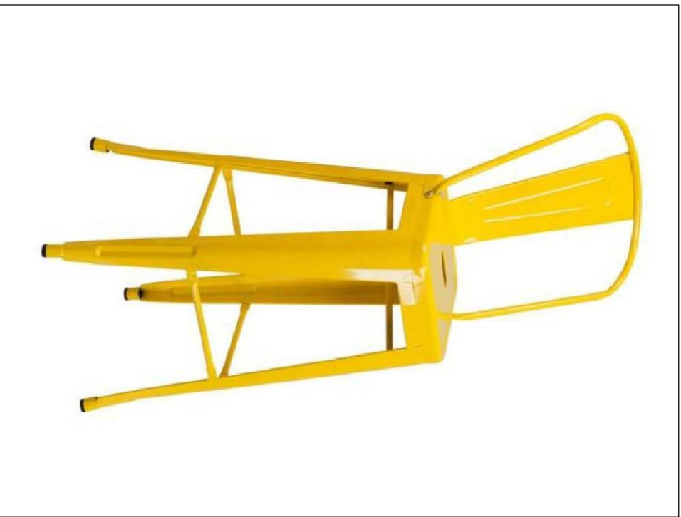
PROPOSED OUTDOOR BAR STOOL QUANTITY = 4