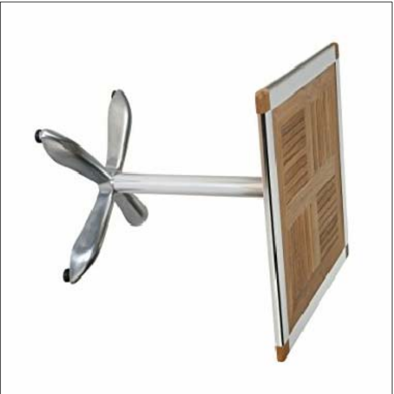
PROPOSED OUTDOOR REGULAR DINING TABLE, 29" H QUANTITY = 1