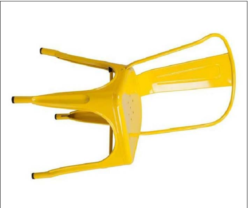
PROPOSED OUTDOOR REGULAR DINING CHAIR QUANTITY = 2